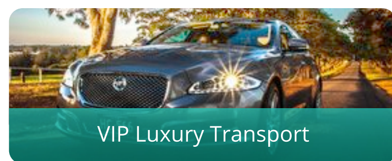
VIP Luxury Transport